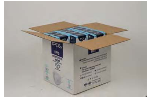
Einzel verpackt EAN