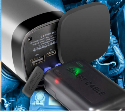
Connect the jump starter clamps cable to PA0266.