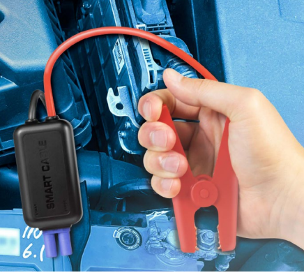
Connect the clamps to the vehicles battery.