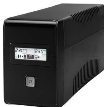
Art- No: 310058