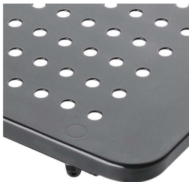
Increase air circulation