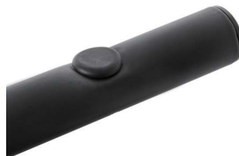
Non-skid rubber pads