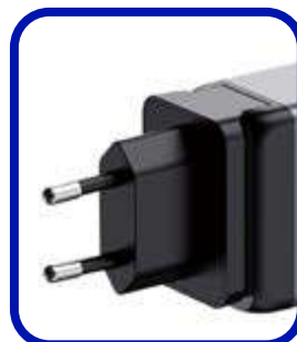
EU Type C