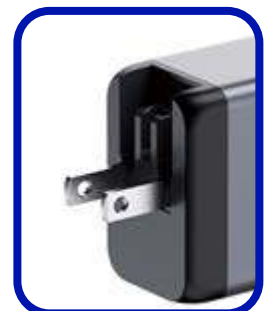
US Type A