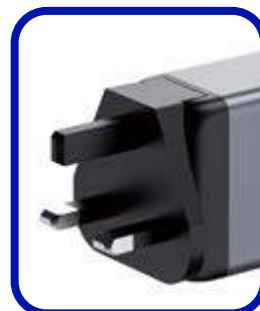
UK Type G