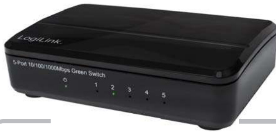
Art No. NS0105