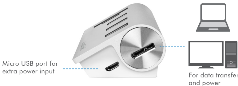
Micro USB port for extra power input