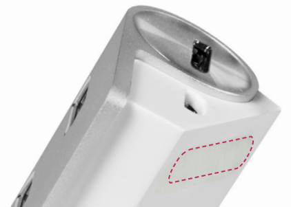
Reinforced anti-slip design