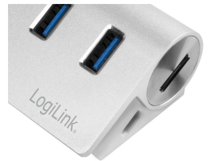
Stylish aluminum design