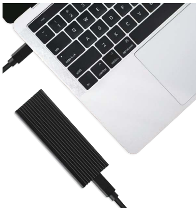
Plug and Play