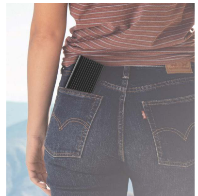
Pocket Size and Easy to Carry